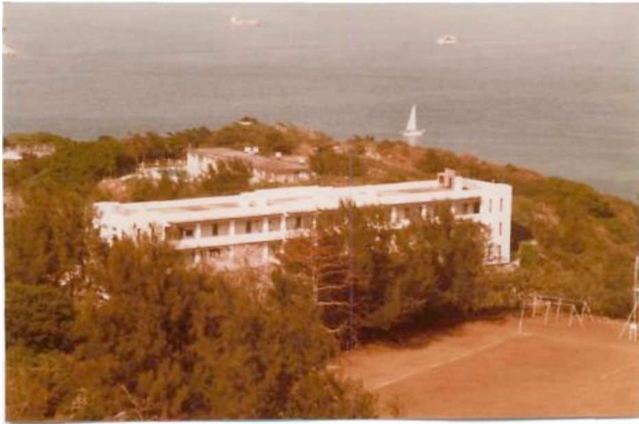
The school block in Lyemun Barracks